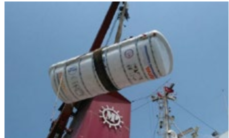
2008 World's 1 st liferaft rental programme