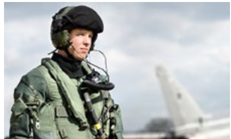
2000 World's 1 st full coverage Anti-G suit