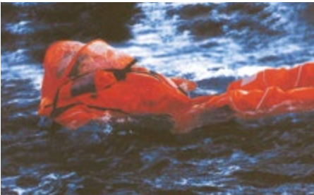
2007 World's 1 st combined helicopter and offshore suit