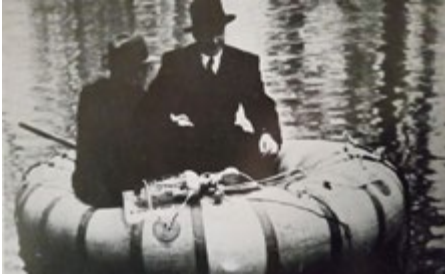
1932 World's 1 st inflatable liferaft