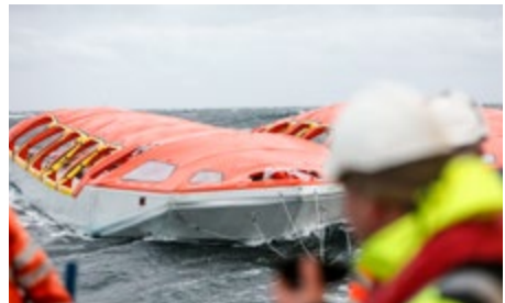
2022 World's 1 st alternative Evacuation System, Seahaven