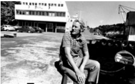
1985 World's 1 st Nitrogen System using hollow fibre membranes