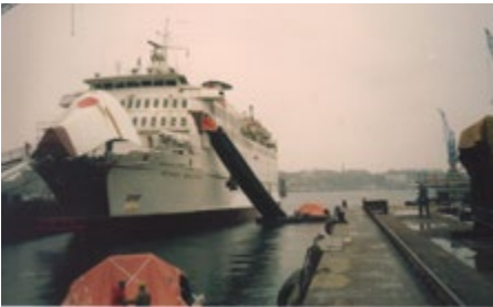
1979 World's 1 st Marine Evacuation System