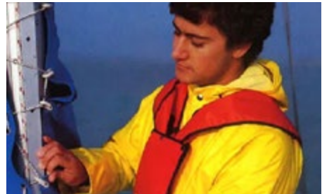
1980 World's 1 st Gas operated lifejacket