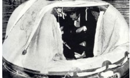
1965 World's 1 st SOLAS approved liferaft