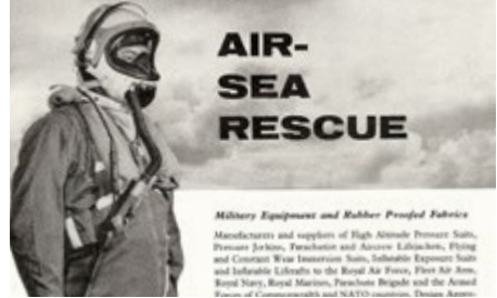
1950 World's 1 st Fast Jet escape suit