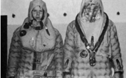
1952 World's 1 st Submarine escape suit