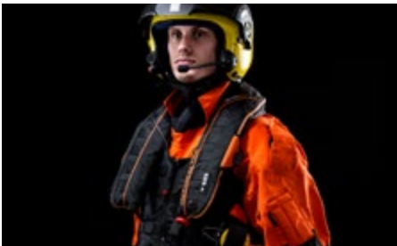
2012 World's 1 st lifejacket with emergency breathing system