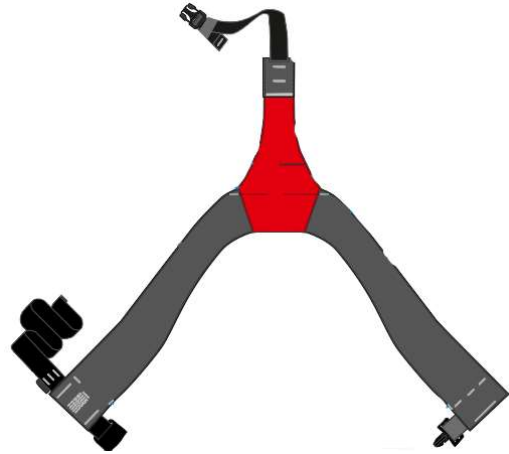
01194 – 3 Crewfit Sport 165N