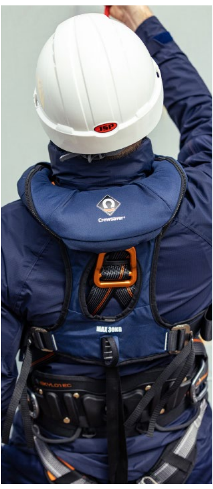
Compatible with a majority of fall arrest harnesses. Does not include fall arrest harness as standard